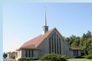
ST. MARY Catholic Church

Congratulations on the newest member of your family! Parents wishing to have their child baptized are asked to contact the Parish Office to make an appointment for pre-baptismal instruction.