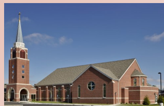
ST. JOSEPH Catholic Church

319 East South Street Lebanon, IN 46052 765-482-5558 www.stjoeleb.org