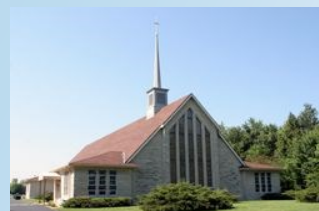
ST. MARY Catholic Church

Congratulations on the newest member of your family! Parents wishing to have their child baptized are asked to contact the Parish Office to make an appointment for pre-baptismal instruction.