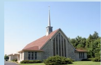
ST. MARY Catholic Church

Congratulations on the newest member of your family! Parents wishing to have their child baptized are asked to contact the Parish Office to make an appointment for pre-baptismal instruction.