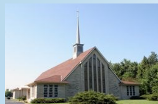
ST. MARY Catholic Church

Congratulations on the newest member of your family! Parents wishing to have their child baptized are asked to contact the Parish Office to make an appointment for pre-baptismal instruction.