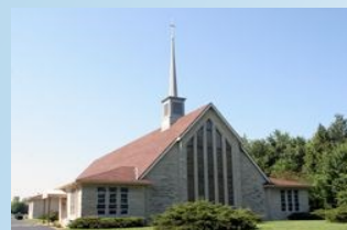
ST. MARY Catholic Church

Congratulations on the newest member of your family! Parents wishing to have their child baptized are asked to contact the Parish Office to make an appointment for pre-baptismal instruction.