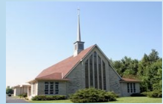
ST. MARY Catholic Church

Congratulations on the newest member of your family! Parents wishing to have their child baptized are asked to contact the Parish Office to make an appointment for pre-baptismal instruction.