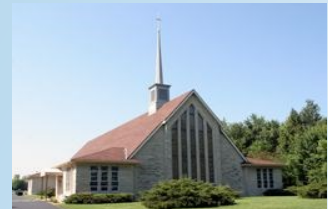
ST. MARY Catholic Church

Congratulations on the newest member of your family! Parents wishing to have their child baptized are asked to contact the Parish Office to make an appointment for pre-baptismal instruction.