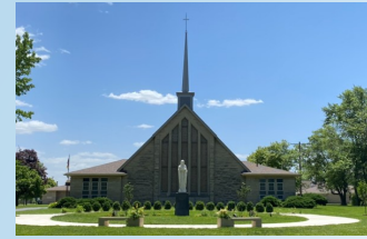
ST. MARY Catholic Church

Damos la bienvenida a todos los que celebran con nosotros este fin de semana. Si usted es nuevo en la parroquia, por favor comuníquese con la Oficina Parroquial para que podamos recibirlo adecuadamente.