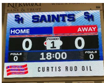
Logo recognition on the bottom bar of the scoreboard