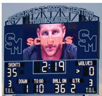
Video ads on scoreboard at Smrekar Field