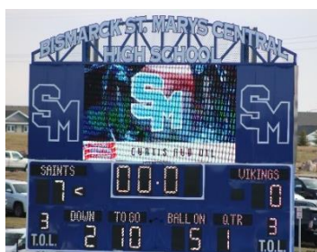
Logo recognition on the bottom bar of the scoreboard