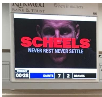
Video ads on scoreboard at Tony Wald Court