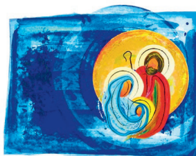
CENTENNIAL APPEAL FOR THE POOR

Click the "Give Online" tab on our website or download the free Online Giving app (iOS/Android) and register with our church (ID:1881).