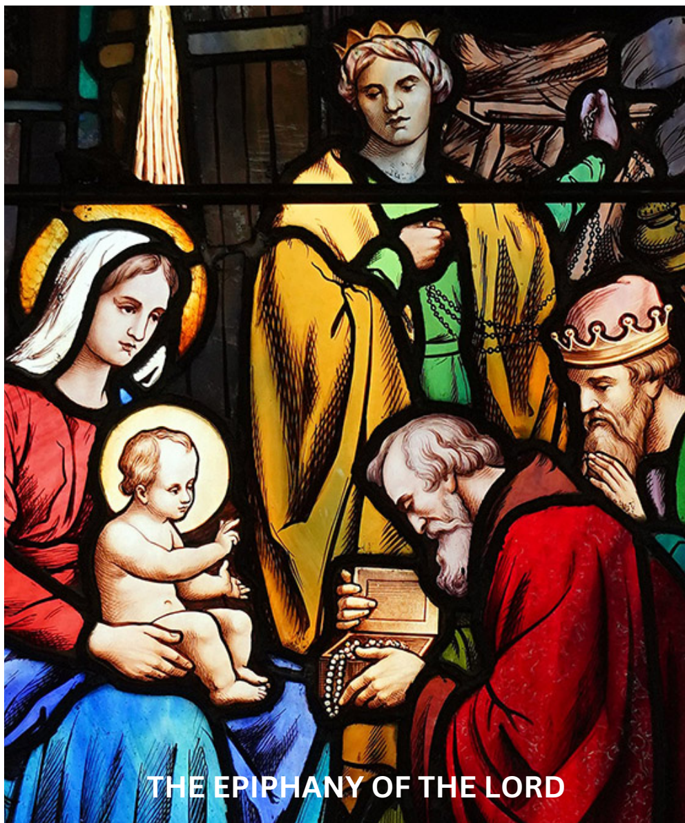
THE EPIPHANY OF THE LORD