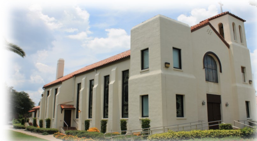
Historic Chapel: 800 S. Oak Ave., Sanford