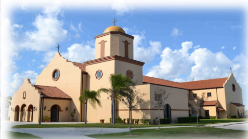
Church: 3280 W. 1st St. (SR #46), Sanford