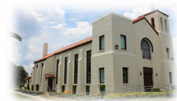
Historic Chapel 800 S. Oak Ave. Sanford

“Whoever eats my flesh and drinks my blood remains in me and I in him. Just as the living Father sent me and I have life because of the Father, so also the one who feeds on me will have life because of me.”