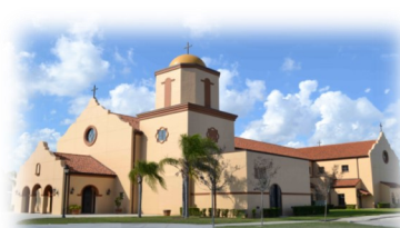
Church 3280 W. 1st St. (SR #46) Sanford