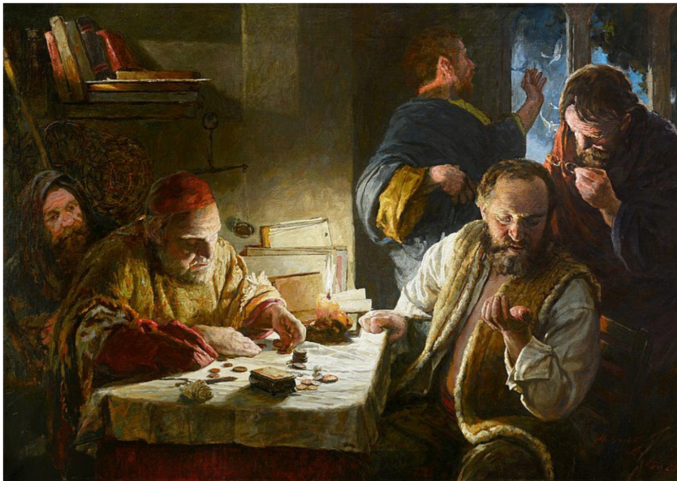
The Parable of the Pearl by Andrei Mironov