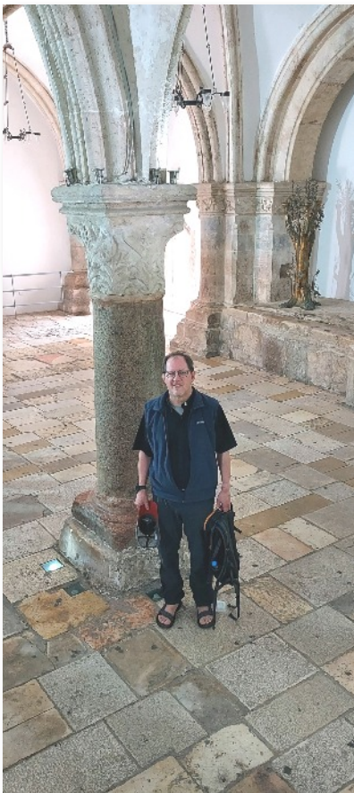
Traditional Upper Room