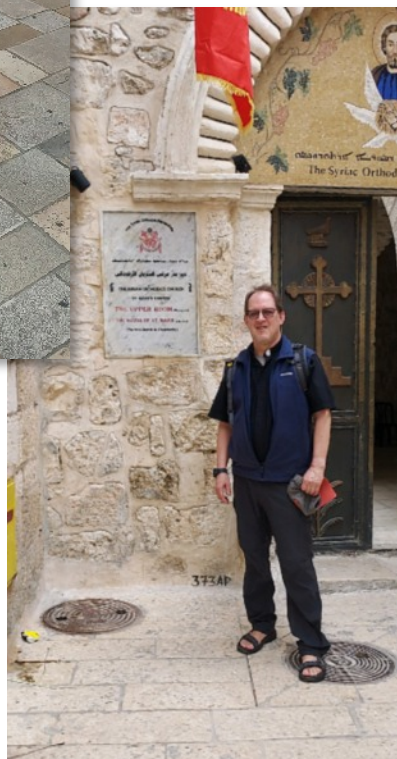
Orthodox Alternative Upper Room (exterior)