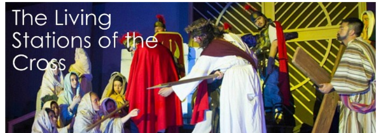
The Living Stations of the Cross