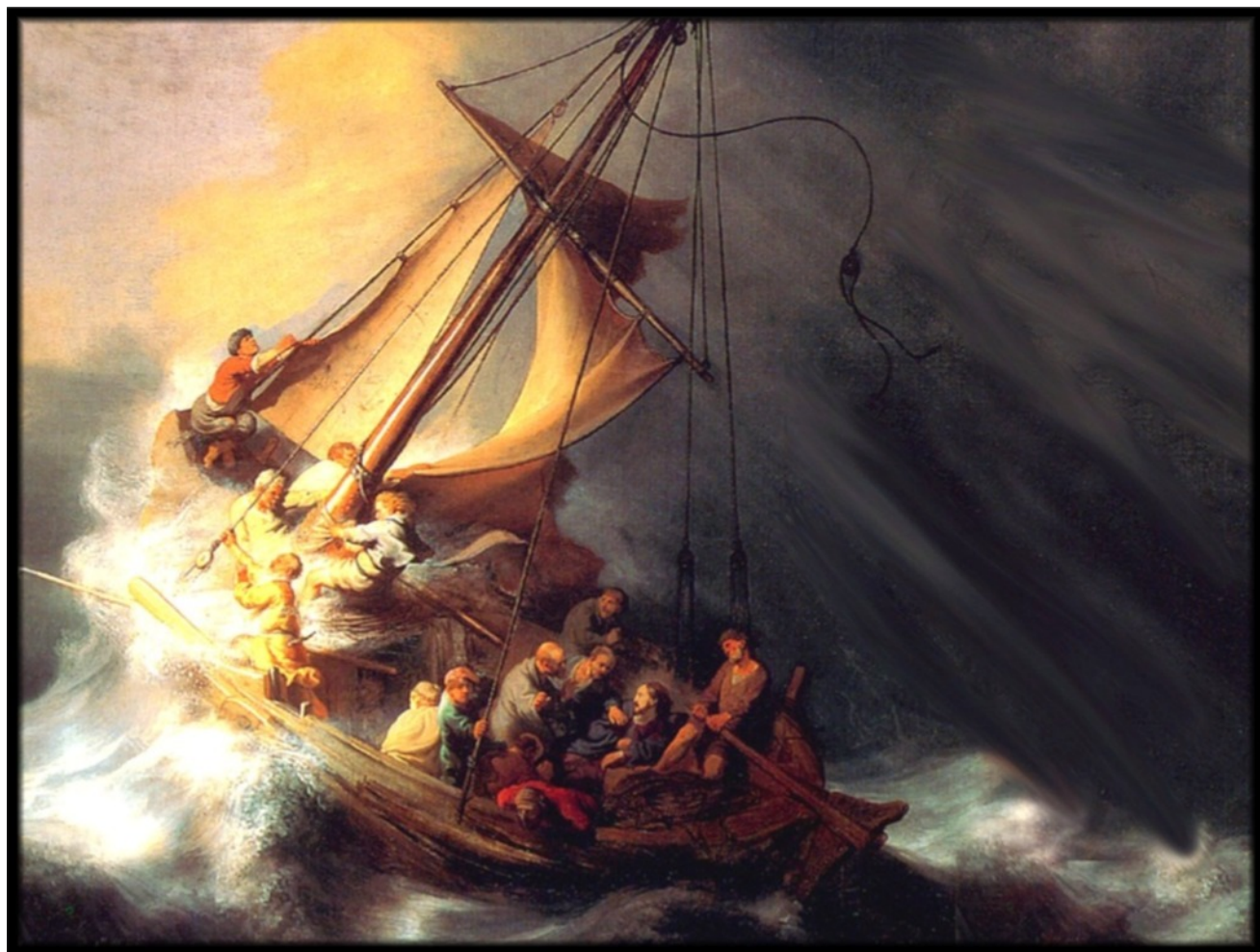
The Storm on the Sea of Galilee, 1633 oil-on-canvas painting by Rembrandt van Rijn (adapted)