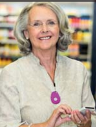
GPS Mobile Above

No Contract • No Fees • Easy Setup • md-medalert.com CALL 800-890-8615