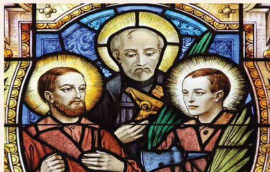
STs. JEAN DE LANDE, ISAAC JOGUES AND RENE GOUPIL, DEPICTED IN A STAINED-GLASS WINDOW AT THE CATHEDRAL-BASILICA OF NOTRE-DAME OF QUEBEC IN QUEBEC CITY.