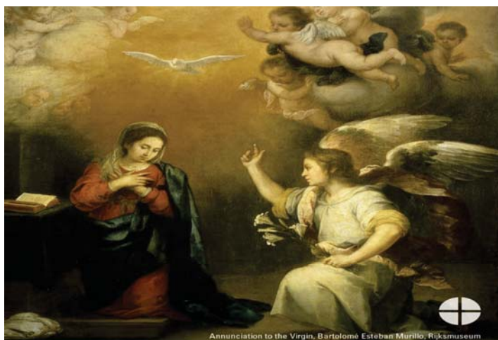
Annunciation to the Virgin, Bartolomé Esteban Murillo, Rijksmuseum