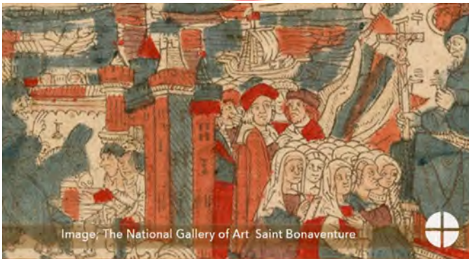
Saint Bonaventure

Rejoice in the Lord always; again I say, rejoice! The Lord is near. Phil 4: 4, 5