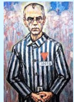
Saint Maximilian Kolbe

Won't you join the 134 Notre Dame parishioners who weekly adore our Lord in Eucharistic Adoration? Are YOU one of the 22 that Jesus is calling to fill our perpetual adoration schedule?