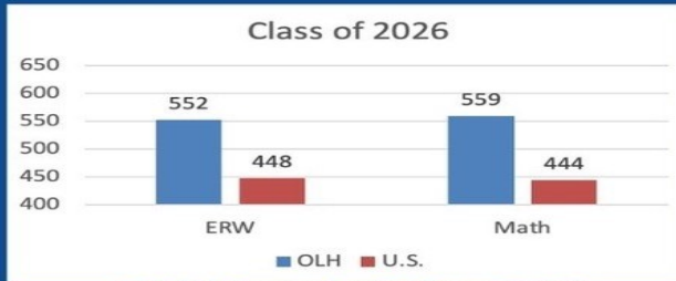
PSAT 8/9 Scores for the Class of 2026