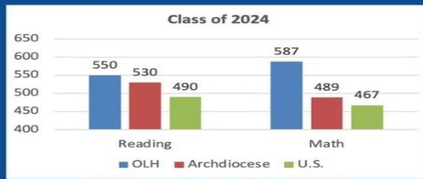
SAT Scores for the Class of 2024