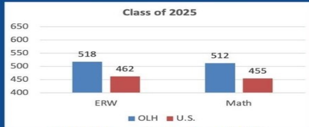
PSAT 10 Scores for the Class of 2025