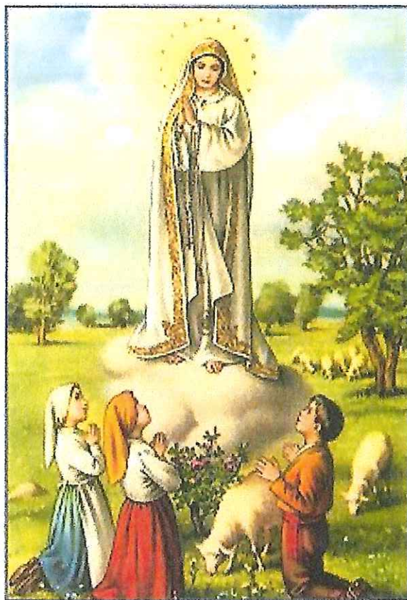
Our Lady of Fatima appears in 1917 to Lucia, and her two cousins, Blessed Francisco and Blessed Jacinta.

One of over 12,000 rallies planned nationwide for this date and time and coordinated nationally by AMERICA NEEDS FATIMA campaign of Tradition, Family and Property.