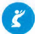
PRAYER & FASTING

You can protect mothers and children by joining this worldwide mobilization to pray and fast for an end to abortion!