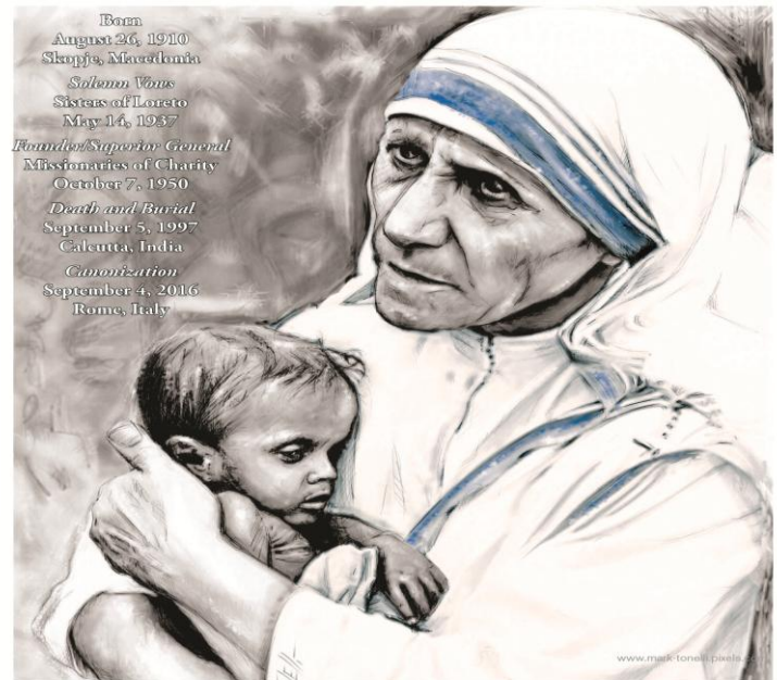
Saint Teresa of Calcutta

Signup sheets are on the bulletin board to volunteer for this parish event.