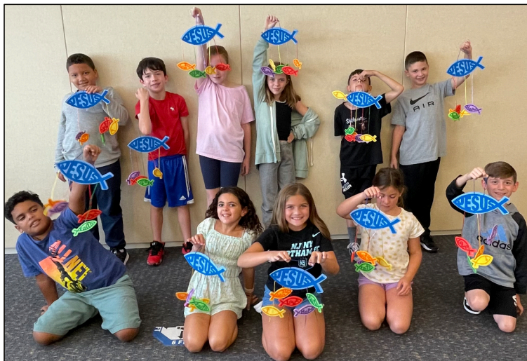
Sunday's 4th grade CCD class enjoyed making a Jesus mobile.