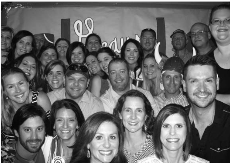
A popular place at the stadium was the "Alumni Photo Booth". Many classmates from 1997 got together for a memorable picture.