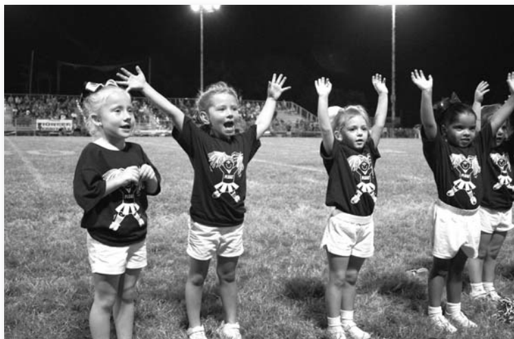
At the annual Flea-Fly game sponsored by the OC Athletic Council, the mini cheerleaders showed off their cheering skills with the help of the OC varsity cheerleader squad.