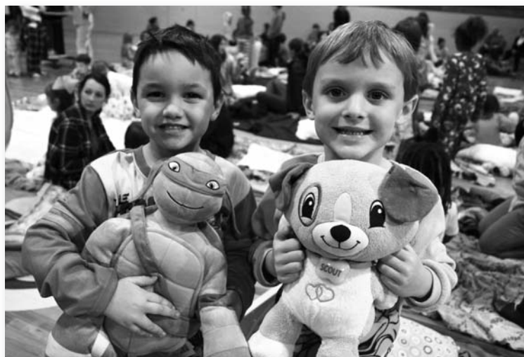
The PTO provided their "Movie Night" again this year to the delight of the children! They came in their pajamas, brought their blankets, and enjoyed milk and cookies while watching "Frosty the Snowman" on a big screen in the gym. It was a fun evening!