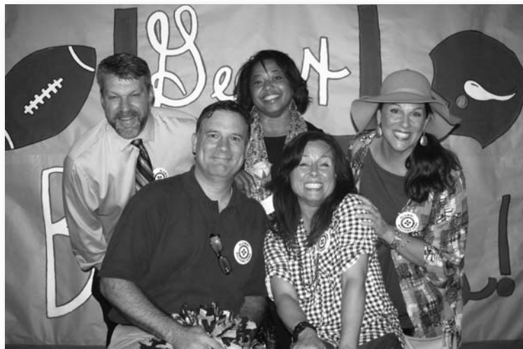
A few members of the 1986-87 group from 30 years ago posed in the "Photo Booth" to make a wonderful keepsake!