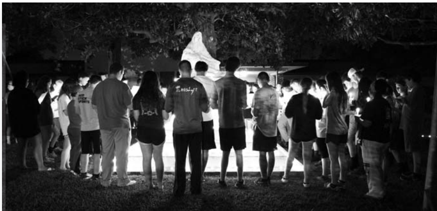
A moving late night Candlelight Prayer Vigil capped off the day of service.