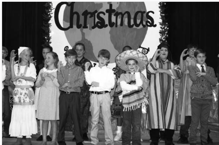
"Christmas around the World" was presented by the preschool and elementary school students for the annual Christmas Play. The gym was packed by parents, grandparents and family members who enjoyed the readings and song presentations.