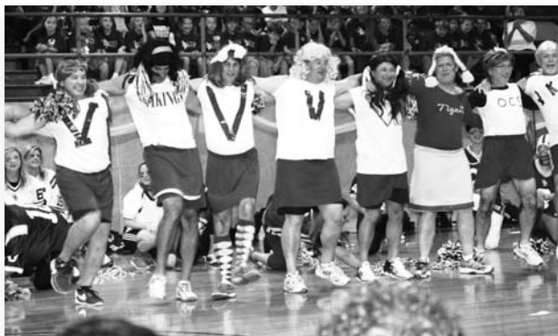
At the Homecoming Pep Rally, even the parents got into the spirit and were very amusing!