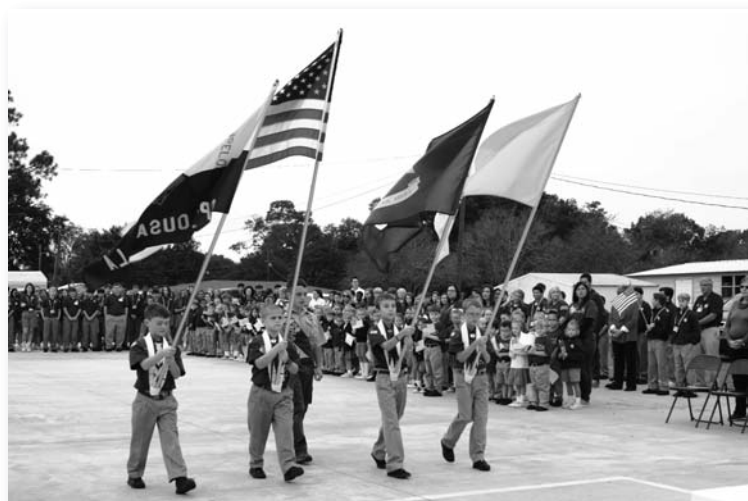
Several members of the OC Cub Scout Pack led in the Color Guard for the annual Veteran's Day program. Local veterans attended, and the proper retirement of a worn U.S. flag was demonstrated by the scouts in an impressive ceremony.