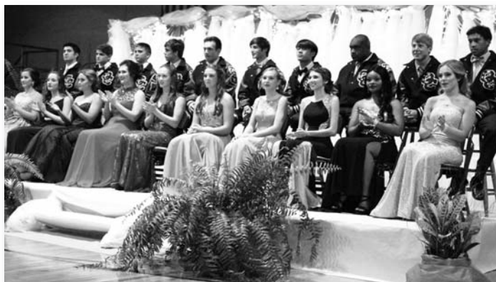
Many members of the 2016 Court watched and enjoyed the Coronation merriment!