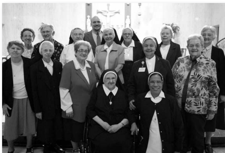
The Marianites came together for a Grand Marshal picture at the closing of the Homecoming Mass in St. Landry Catholic Church.