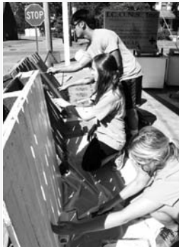
One group of students completed service work at ICONS Food Bank.

All students agreed that this "new beginning" retreat brought them a sense of purpose and responsibility in helping the community. It also was a great bonding experience between the senior mentors working together alongside the freshmen for the common good. After a day's work and group discussions, it was beautiful to see the Candlelight Prayer Vigil around the Pieta late that night. The Holy Spirit was working!