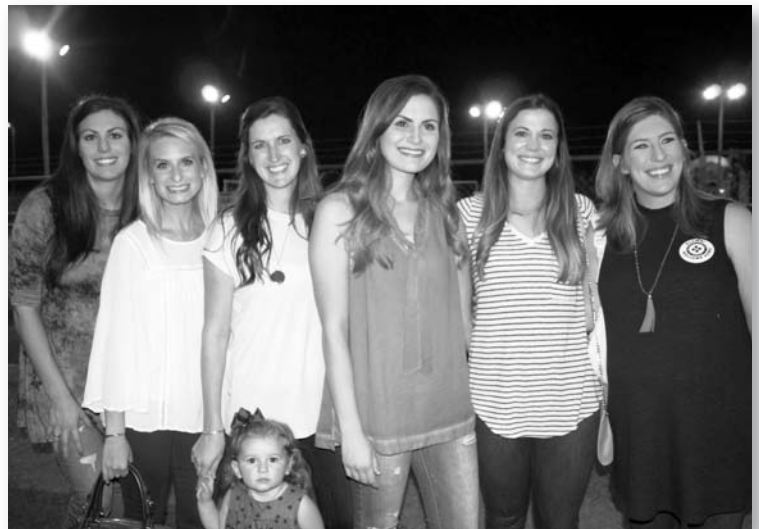
Visiting near the Alumni Welcome Tent was this group of friends from the Class of 2007, reminiscing about their high school days just 10 years ago!