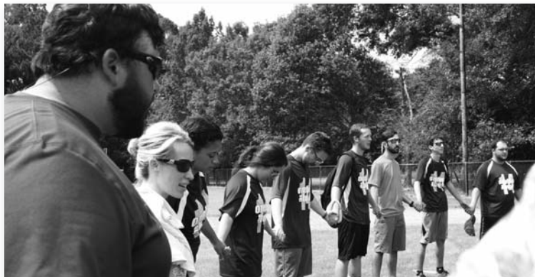
Closing prayer after the final game