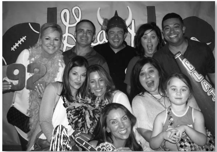
Another photo opportunity was taken by this group from 1992 who was celebrating 25 years since their senior year Homecoming!