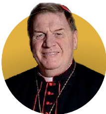
CARDINAL JOSEPH TOBIN

C.Ss.R., D.D. Principal Celebrant and Homilist for Mass