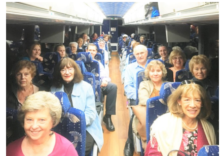
Photo taken on the Pilgrimage/bus trip to Stockbridge, MA, on Wednesday, October 5th. Organized by our Parish Evangelization Team.