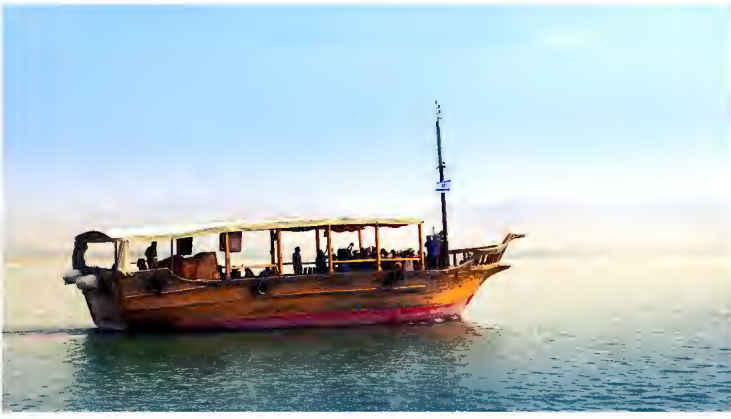
Sea of Galilee - Tiberias

Depart today via Tabgha and Magdala to Cana, site of Jesus' first miracle of turning water into wine. Proceed to Mt. Tabor, traditional site of the Transfiguration. Continue to Nazareth, the boyhood home of Jesus. Here you will visit the Church of the Annunciation and the winding streets of the old city. Proceed via the Jordan Valley and Beit Shean to Jerusalem and your hotel.