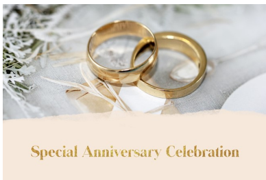
Special Anniversary Celebration