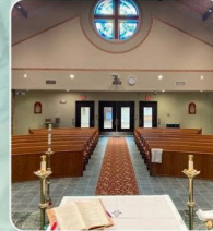
St. Luke, Long Valley

¿Listos para obtener más indulgencias plenas para ti y tus seres queridos fallecidos? ¿Listos para caminar, orar y compartir la comunión con el Obispo Sweeney y otros fieles?