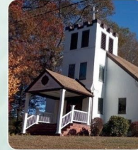
St. James, Montague