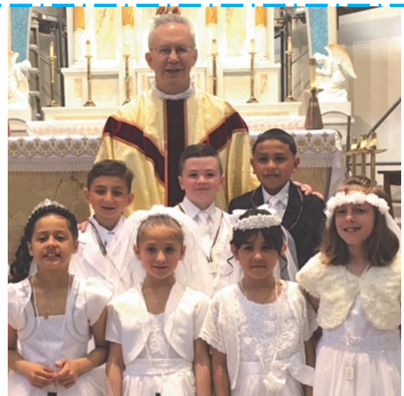
Our Lady of Mt. Carmel First Communicants 2018