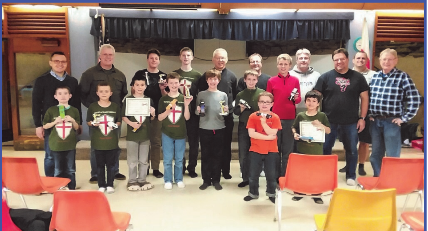
Troops of St. George Pinecar Derby, St. Therese

Feb 16th, 2020 • Sixth Sunday in Ordinary Time