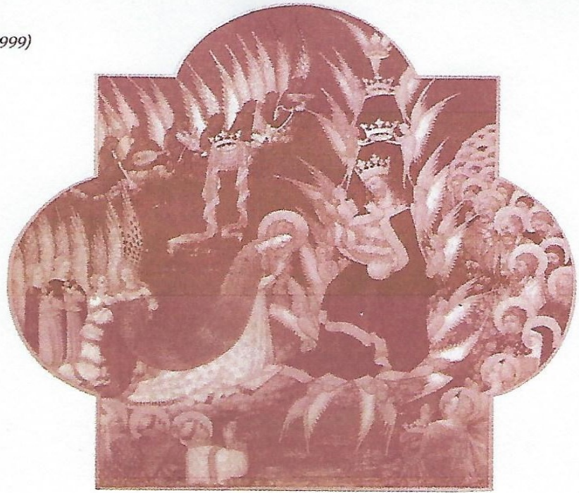
Coronation of the Blessed Virgin Mary Miniature of the Très Riches Heures of the Duke of Berry Limbourg Brothers and Jean Columbe 15th century

'Holier than the Cherubim and Seraphim, she enjoys unquestionably greater glory than all the other saints, for she is full of grace (Lk 1:28), she is the Mother of God, who happily gave birth to the Redeemer for us. Since she is therefore, 'Mother of mercy, our life, our sweetness and our hope,' let us all cry to her 'mourning and weeping in this vale of tears,' and confidently place ourselves and all we have under her patronage. She became our Mother also when the divine Redeemer offered the sacrifice of himself; and hence by this title also, we are her children. She teaches us all the virtues; she gives us her Son and with him all the help we need, for God 'wished us to have everything through Mary' (MD, 169).