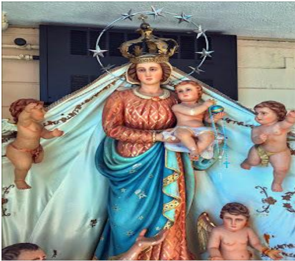
Madonna Santissima dei Miracoli