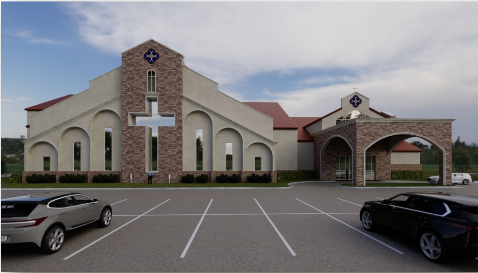
North Perspective from 108th