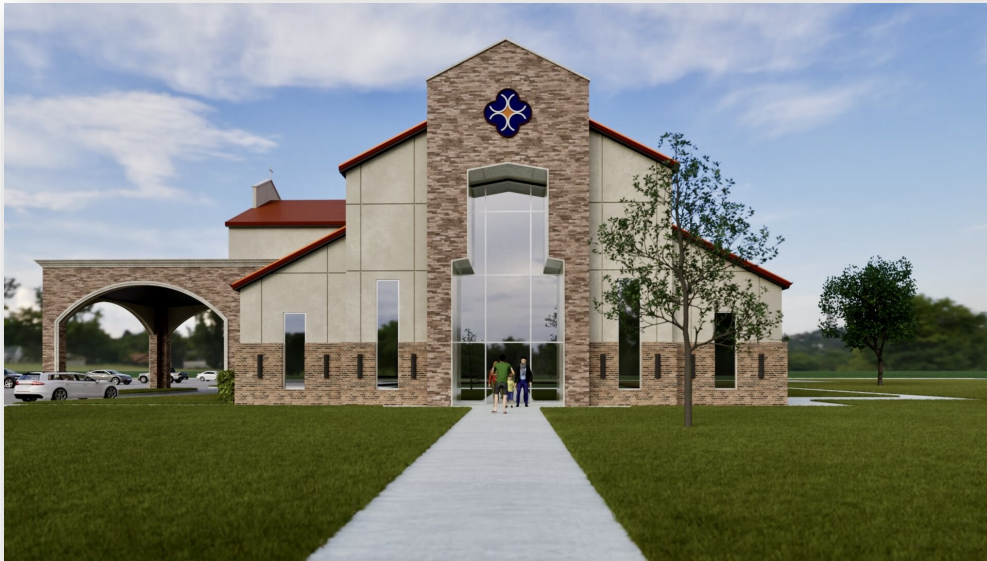
West Perspective from Indiana