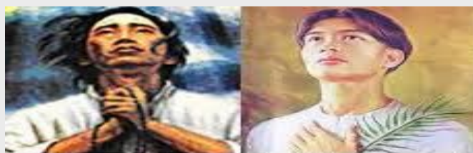
San Lorenzo Ruiz

Please email DCCFM at dccfmevents@gmail.com for more information.