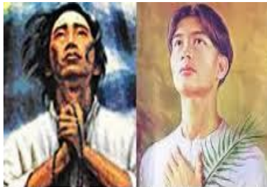
San Lorenzo Ruiz