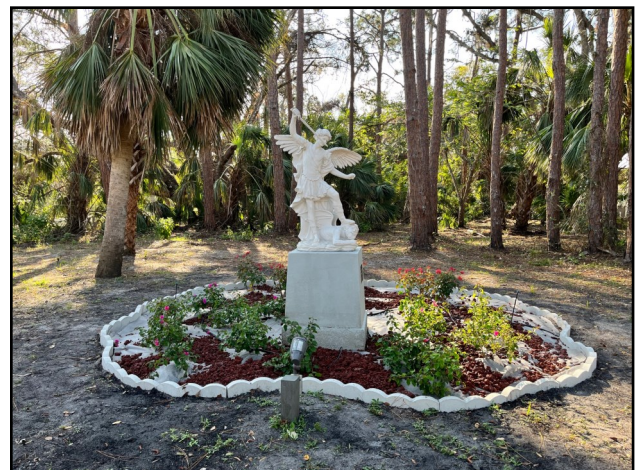
Restoration/Improvement of St. Michael Shrine. Left: St. Michael after the flood. Note the dead plants near the base of the statue. Right: Jatropa plants and dwarf bougainvillea have been replanted, this time with curved edging stone and lava rock. Our crew and volunteers also ran new pipe for a sprinkler system to water these plants.