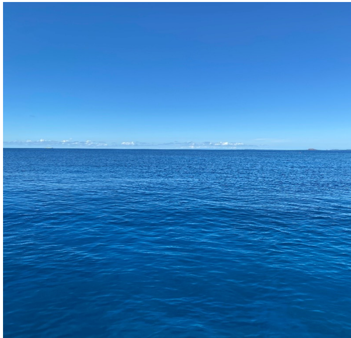
The Caribbean Ocean- St. Thomas, USVI - taken 1-29-20