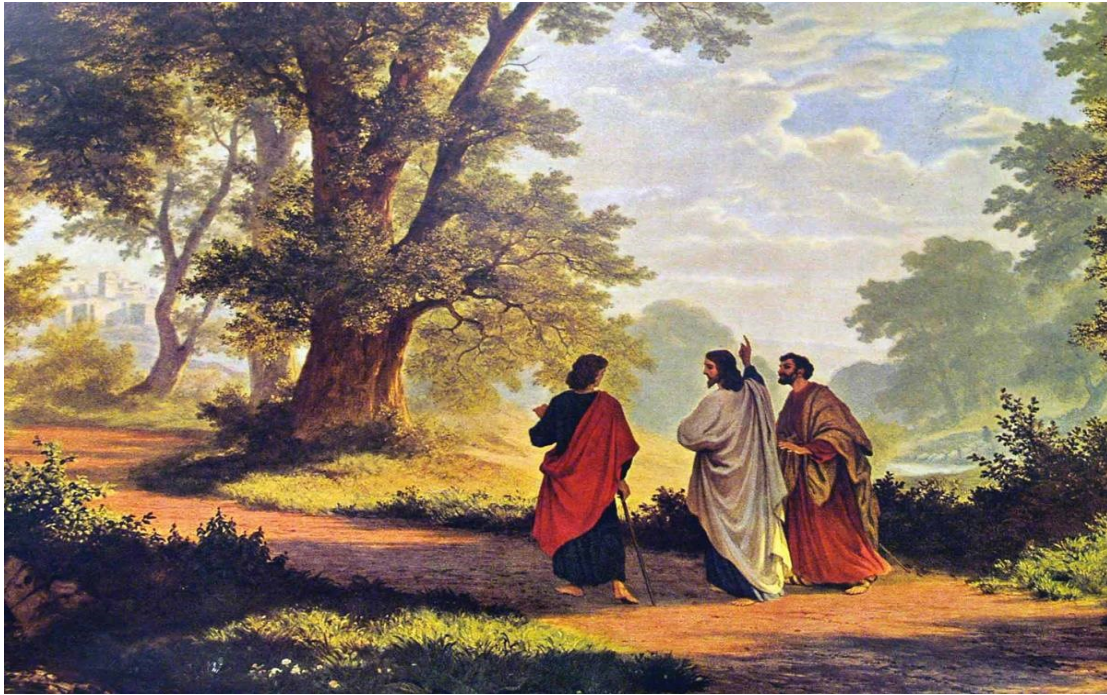
The Road to Emmaus , by Robert Zund (1877). Public domain.

Image accessed at: https://www.umnews.org/en/news/walking-with-christ-do-you-know-the-way-to-emmaus