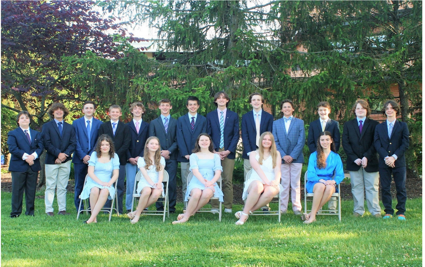
Congratulations to our 2023 8th Grade graduating class!