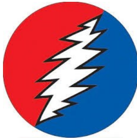
Image accessed at: https://rockabilia.com/products/grateful-dead-bolt-button-433277

“Wake up to find out that you are the eyes of the world...”- Dead & Company, June 7, 2023