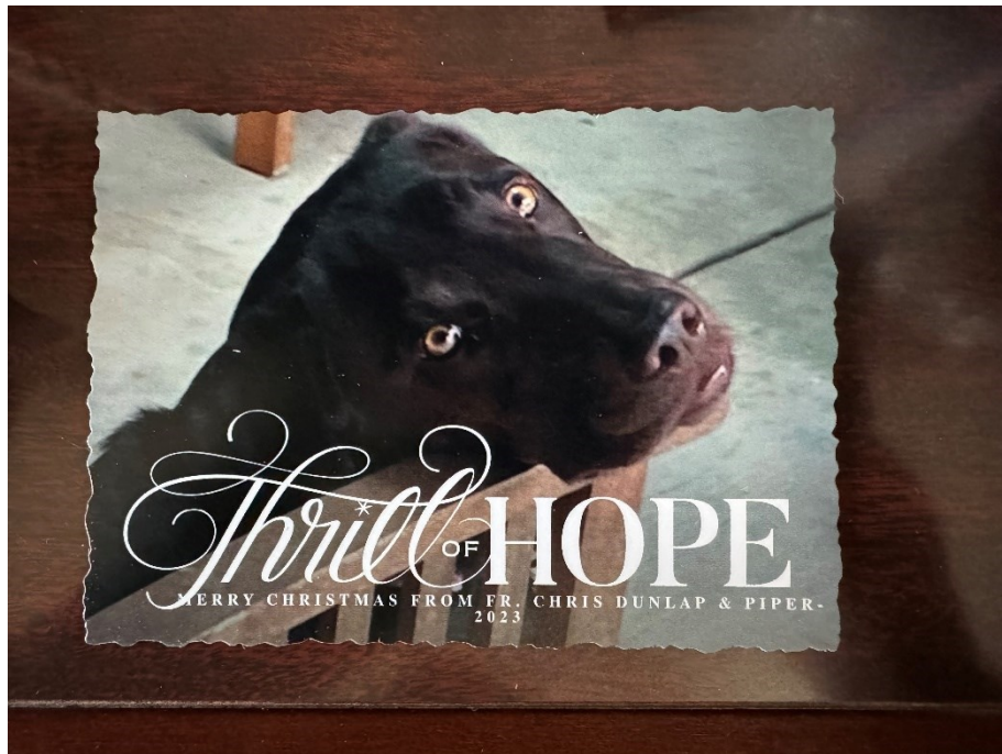
FC's 2023 Christmas card, from simplytoimpress.com:

“A thrill of hope, the weary world rejoices For yonder breaks a new glorious morn Fall on your knees O hear the angels' voices O night divine O night when Christ was born...”