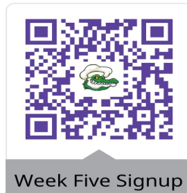
Week Five Signup