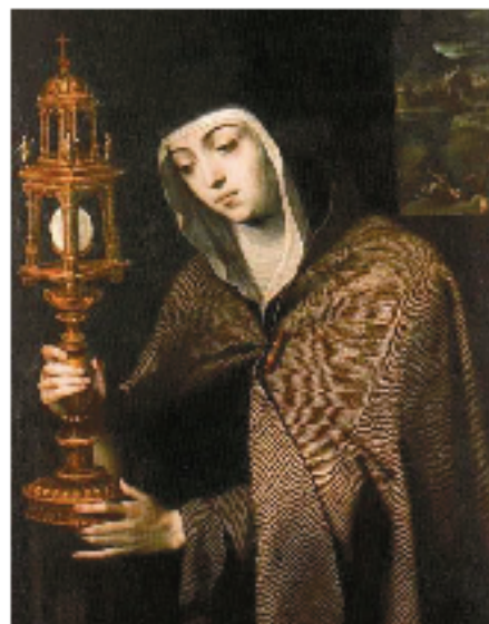
St. Clare with the Monstrance.

An Exploration of the Gift and Call of Women in Contemporary Life