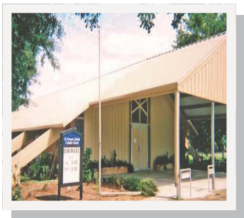
Saint Frances Xavier Cabrini Roman Catholic Mission 901 N. Frederick Kaplan LA 70548