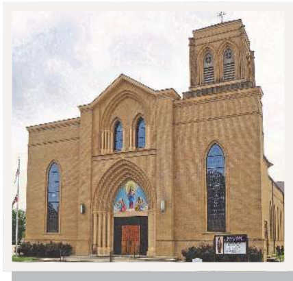
Our Lady of the Most Holy Rosary Roman Catholic Church 602 N. Church Ave Kaplan, LA 70548