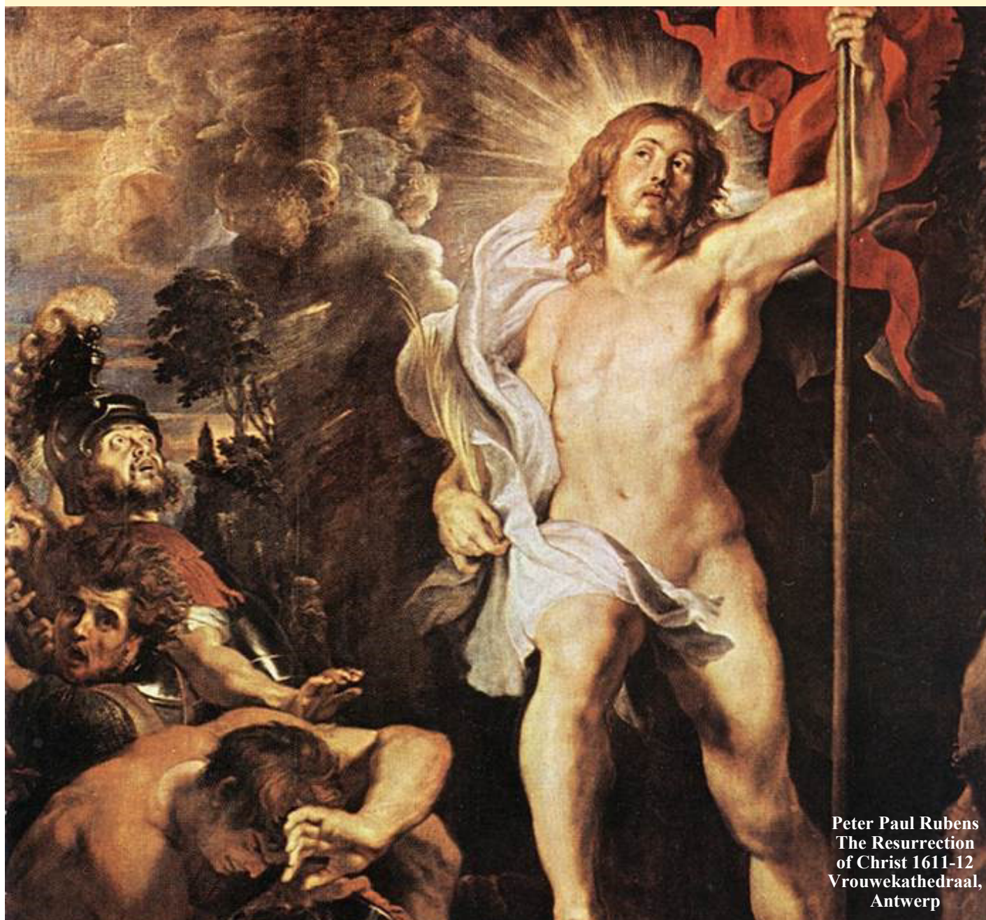
Peter Paul Rubens The Resurrection of Christ 1611-12 Vrouwekathedraal, Antwerp

401 S. Willow St. Ellensburg, WA 98926 Office (509) 962-9819