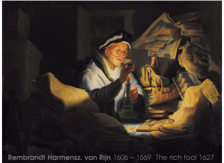
Rembrandt Harmensz. van Rijn 1606 – 1669 The rich fool 1627

In the early 17th century, a stack of books was often used as a symbol of vanity. The Hebrew letters suggest a Biblical setting. The usual interpretation of the parable is that there is no point in spending a life gathering wealth. After all, once you die money is of no use. It might even get into the hands of people who do not deserve it. It is therefore thought to be wiser to be "rich toward God."